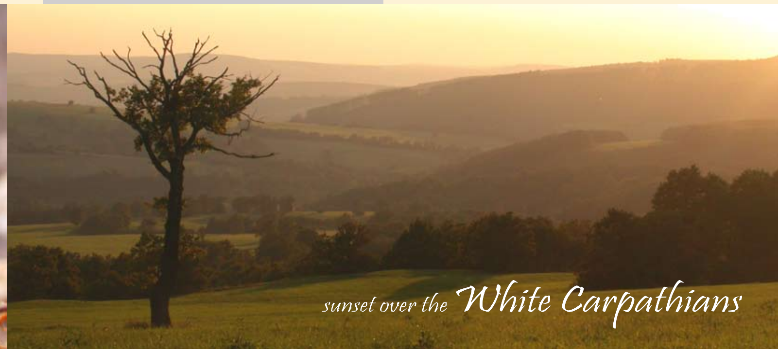
sunset over the White Carpathians