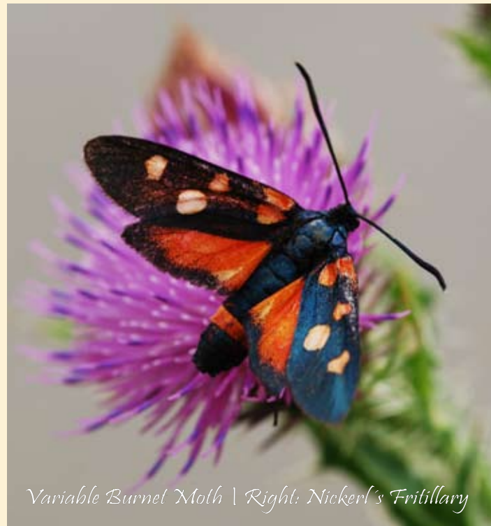
Variable Burnet Moth | Right: Nickerl's Fritillary

The largest limestone karstic area of Central Europe with several large caves and hundreds of sink holes. Formerly much grazed, many of the pastures are abandoned now. One of the best sites for butterflies in the whole region e.g. Woodland Brown or gliders.