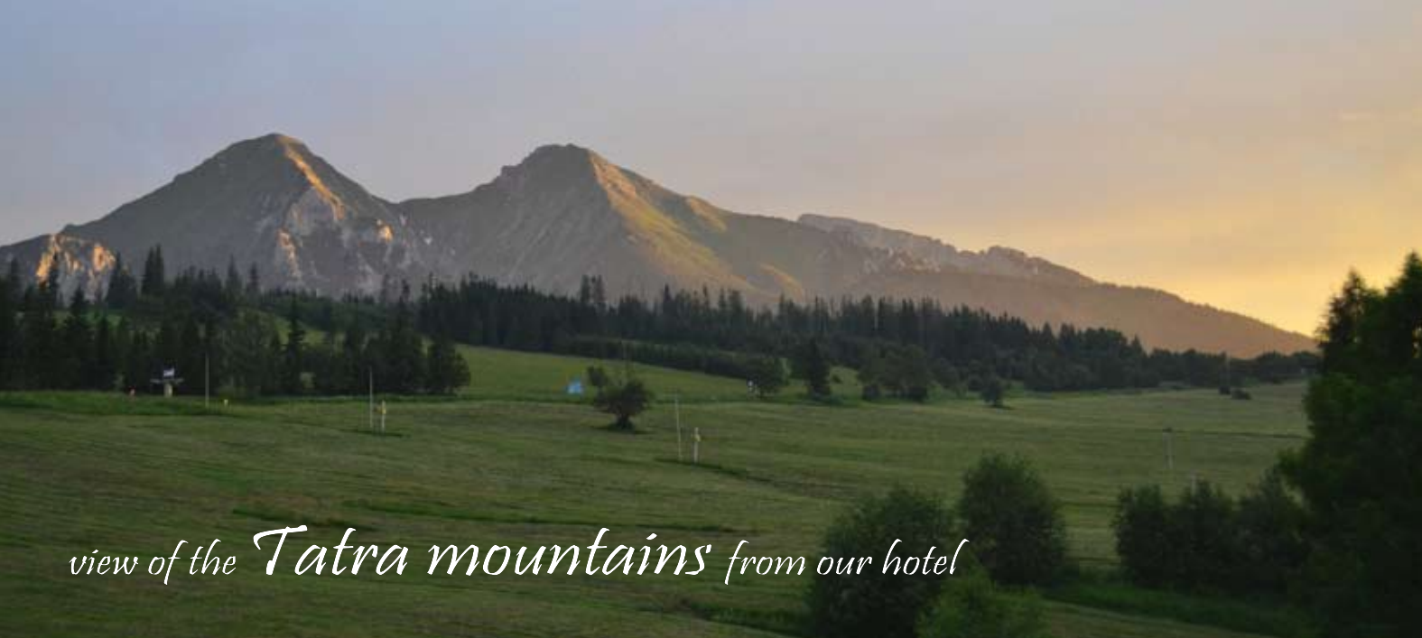
view of the Tatra mountains from our hotel