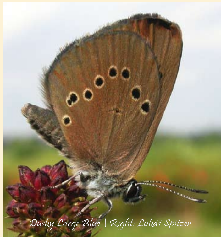
Dusky Large Blue | Right: Lukáš Spitzer