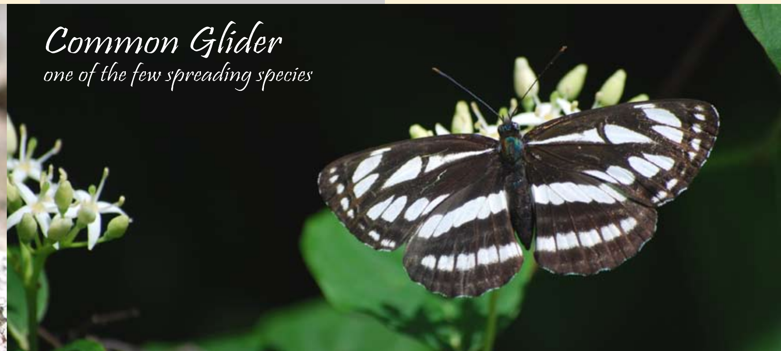
Common Glider one of the few spreading species