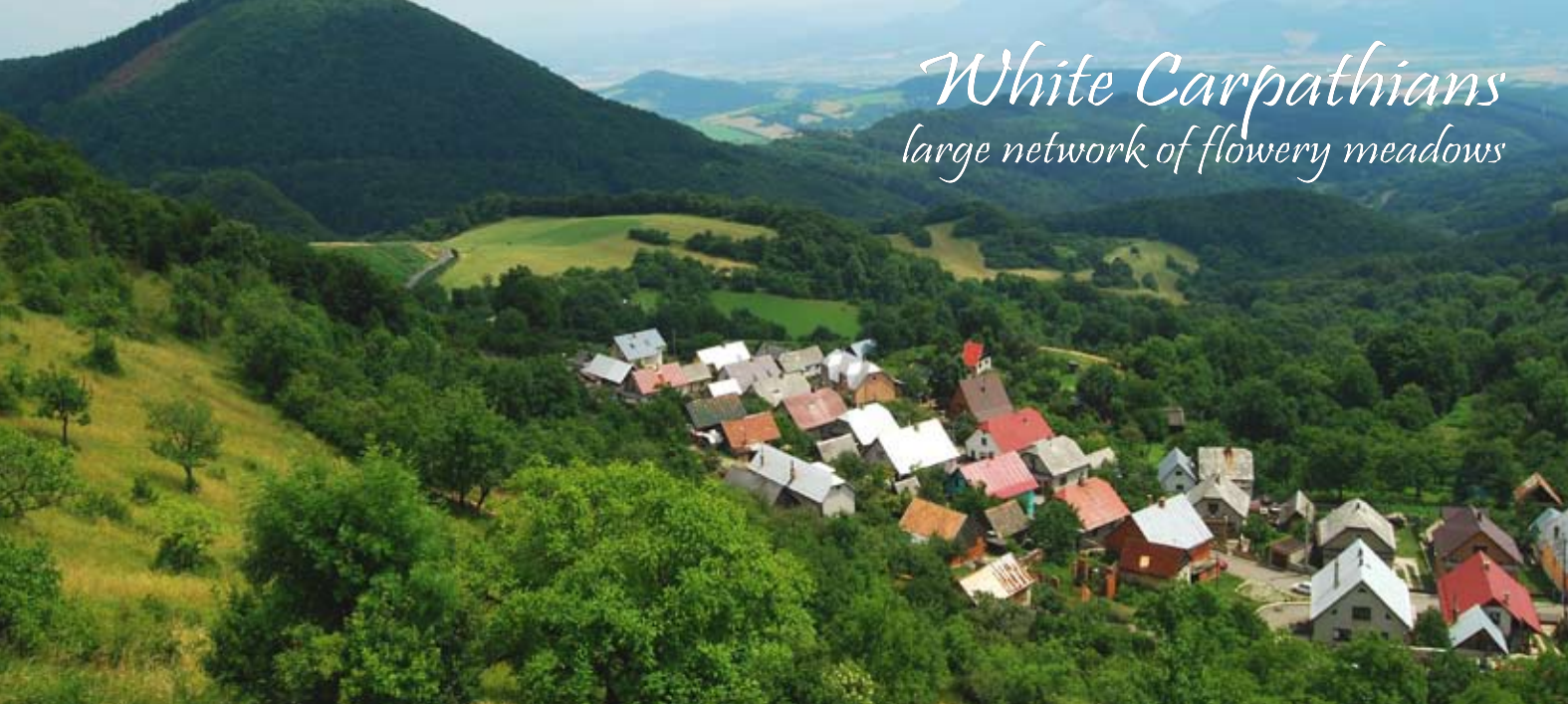
White Carpathians large network of flowery meadows