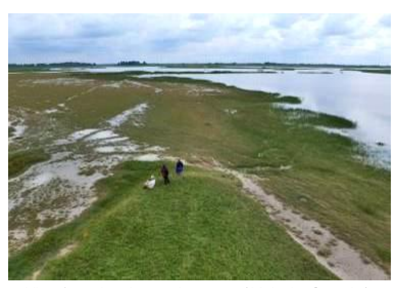
View from the observation tower (Malcolm Crowder).

brought about by the physiological drought caused by the dissolved salts in the groundwater. Here and there on raised areas of dune the vegetation took on a more normal appearance of dry grassland. Arriving at the farmstead bordering the lake it soon became clear that the water levels were extremely high compared to 2012, going some way to explain the displacement of the Kentish plovers we'd seen at Bösztörpuszta a couple of days ago. The Böddi-szék is one of the last sites for nesting Kentish plovers in Hungary but this year the conditions are evidently not up to scratch. Another 'coastal' species which finds conditions inland on the soda lakes to its liking was present however and we rapidly connected with a flock of avocets.