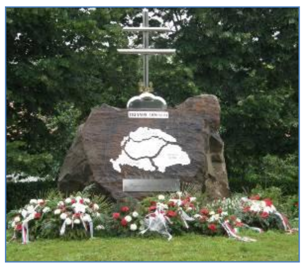
Memorial to Greater Hungary. Present-day Hungary is the central part.

Parking by the town church, we made our way up some steps, past several impressive firebug aggregations on the church walls and onto the viewpoint overlooking the marshes, again created from 'amputated' oxbows. Unlike the recce visit in 2012 when water levels were low, the wetland was in