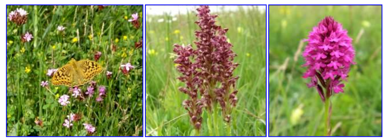
Cardinal fritillary, bug orchids, and pyramidal orchid.

Out of the wind behind a shelter-belt of false acacia we were treated to some splendid views of golden oriole, lesser grey shrike and hoopoe, all nesting in close proximity. A queen of Spain fritillary was laying her eggs on field pansies and a flock of tree sparrows flitted in and out of the standing barley. We stopped briefly at the 110 year-old Romanesque - Eclectic Calvinist church of Kunpuszta, seemingly isolated but apparently strategically located to serve to several communities, then walked a little further, admiring Danzig vetch, dragon's teeth, more poppies and cornflowers and another lesser grey shrike before driving on a short distance to a meadow with verbena-leaved clary, dianthus, and in the shelter of its far edge a nice selection of butterflies including grizzled skipper, chestnut heath, green underside blue, brown argus, Niobe fritillary and cardinal fritillary. The cardinal was carefully caught to reveal the red flush on its underside forewing which distinguishes it from the similar-looking silver-washed fritillary, and the Niobe was identified from photographs later.