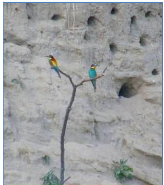
Bee-eaters at the colony near Apaj.

With the conditions still warm, after dinner it was down the track to see some nightjars. A large bright green sand