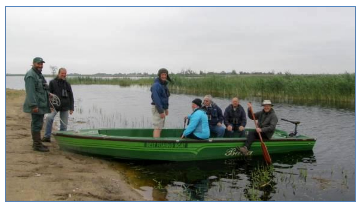
The start of our privileged tour of Lake Kolon.

When we arrived at the observatory we were given a short introduction on the ringing work (a MILE of mist-nets!) and the massive restoration project costing 2 billion Hungarian forints (more than £5½ million of EU funds) which has seen the lake return to something like its original glory following its drainage during the post-war period under communism.