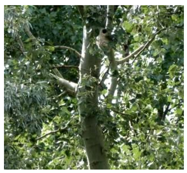
Penduline tits' nest high up in a white poplar. (Colin Taylor)

In the afternoon it was back to freshwater once again and the Kiskunsági – főcsatorna or 'Snakey channel' which once was used (and perhaps will be again) to bring water from the Danube to the heart of the Kiskunság. There was a nightingale singing here, and a 'gravel' pit with an excellent range of dragonflies including Norfolk hawker, black-tailed and white-tailed skimmers and whitelegged damselfly. We watched a male penduline tit put the finishing touches to a beautifully constructed, pouch-shaped nest hanging from a branch on a tall white poplar, to the constant accompaniment (in these habitats of riverine poplars and willows) of calling golden orioles and turtle doves A muddy puddle filled with several bright 'green' frogs provided a few minutes of entertainment and explained the popularity of the site with night herons. By this time we were well on into late afternoon and it was time to head home.