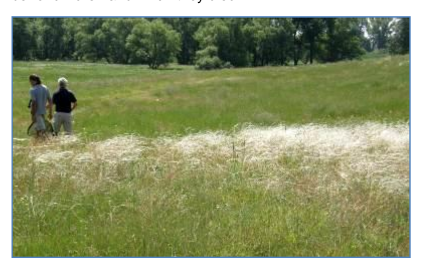
At the cemetery site: Queen of Spain fritillary and ethereal steppe grass.

The only bittern seen on the trip flew briefly across the marsh but there were few birds to speak of other than a brood of newly-fledged yellow wagtails. The small yellow sand irises Iris arenaria subsp. humilis for which the site is famous had gone over and pride of place went to the butterflies, including large heath and chestnut heath as well as safflower skipper.