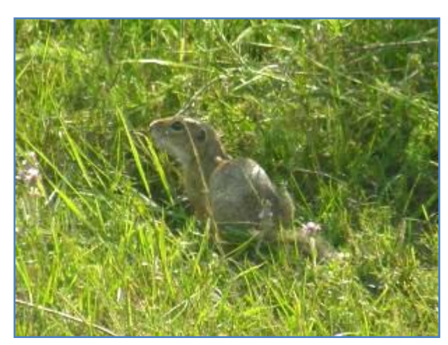
Black woodpecker at Lakiteleki-Holt-Tisza as the sky darkened before a downpour; and souslik near Kun Hill.