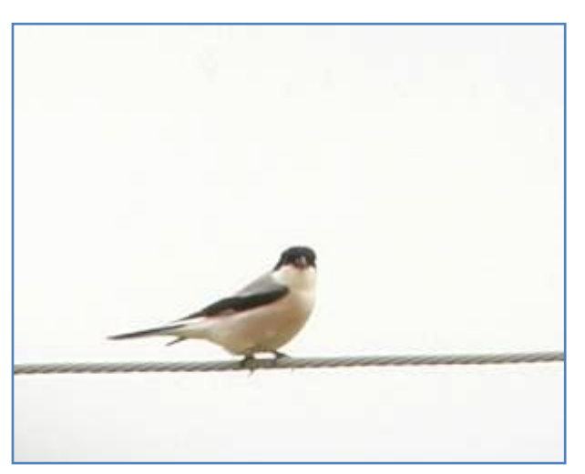
Lesser grey shrike (digiscoped).

onto a sandy track with a false acacia plantation on one side and a grazed field on the other – the 'souslik field'. The European ground squirrel ( Spermophilus citellus ), also known as the European souslik, is a medium-sized rodent (200g-400g) living in dry grasslands in many parts of southern and eastern Europe and is the main prey of the saker falcon and many other large raptors. The fields to the east of Kondor Lodge support a thriving population, which are usually easy to see as the fields are closely cropped by horses. We did manage to catch a glimpse of a few but the cool and cloudy conditions were evidently not to their liking and we obtained much better views later in the week.